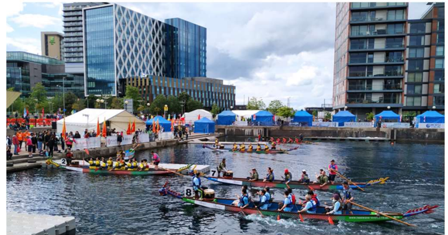
Annual UK Chinese Dragon Boat race Festival