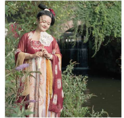
Chinese Students collection workshop at the Museum