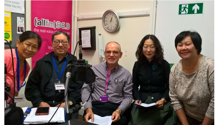
Radio Sheung Lok, Wai Yin Society, June 2018