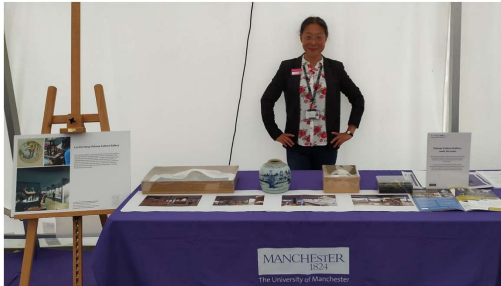
Chinese Culture Gallery stall at the University's Community Festival, June 2022