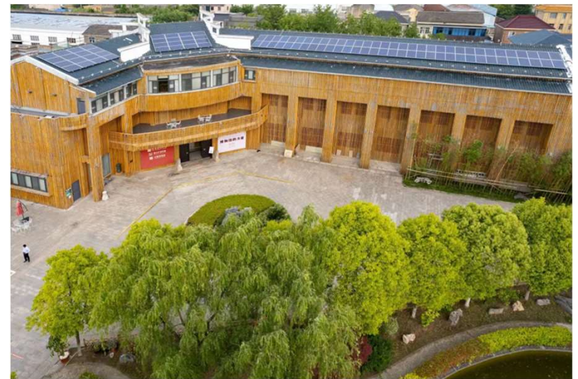
Chen Lyusheng Museum cluster, China - many parts of the building are made of bamboo, almost entirely powered by solar energy