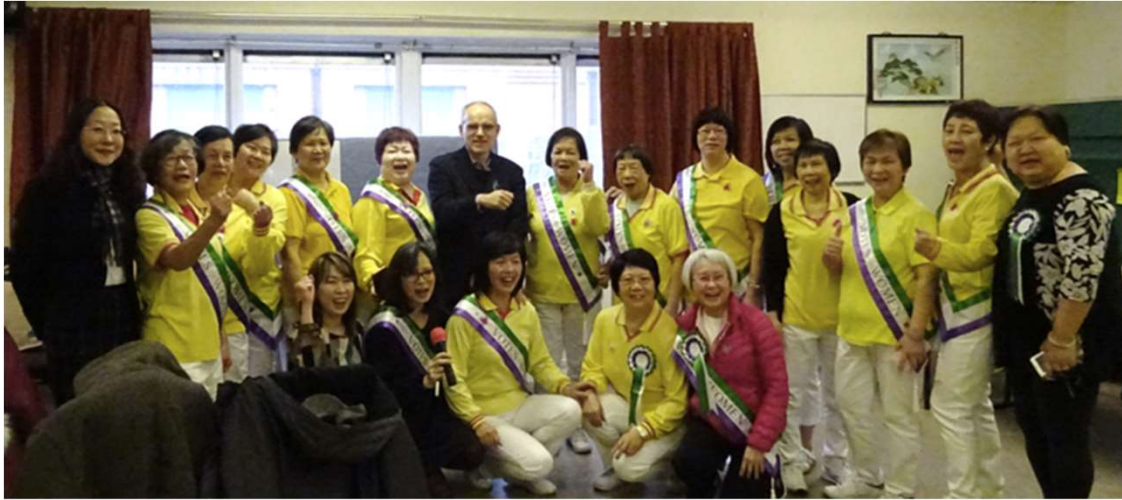
Promoting the new Chinese Culture Gallery, Wai Yin Society, International Women's Day 2018