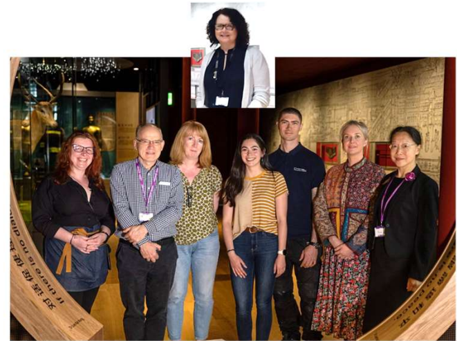
Manchester Museum's Dragon Team 2023

TCM, longevity practice, Tai chi and Dragon Boat Race all promote wellbeing