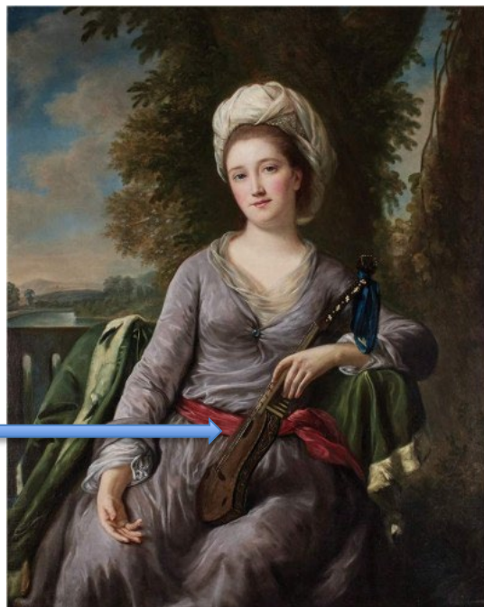
Portrait of a lady holding cittern, c. 1790