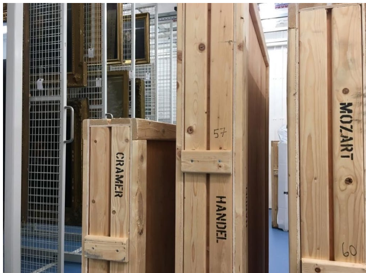
Climate-controlled storage for museum collections.