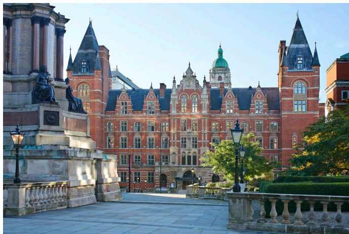
Royal College of Music

Part of the Royal College of Music, London