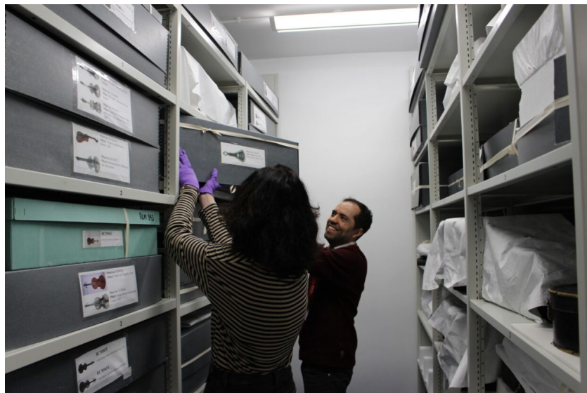
Retrieval of museum collections to our South Kensington site