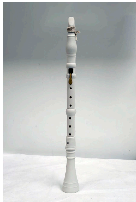
3D reproduction prototype