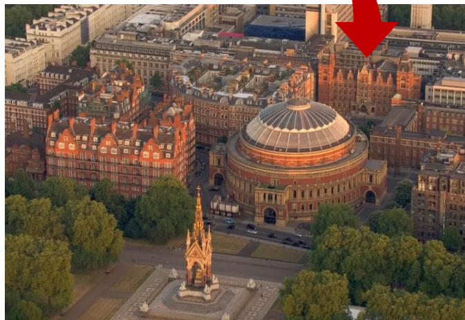
Albertopolis / Exhibition Road South Kensington